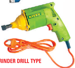
DIA GRINDER DRILL TYPE

www.kittytools.com AN ISO 9001: 2015 CO. www.kittytools.com