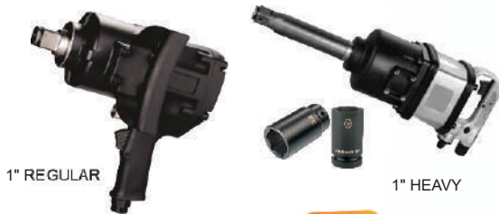
1" REGULAR 1" HEAVY