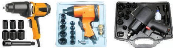
ELECTRIC PNEUMATIC REGULAR PNEUMATIC HEAVY