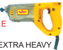
E EXTRA HEAVY INDIAN