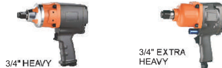
3/4" HEAVY 3/4" EXTRA HEAVY