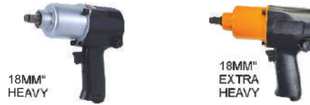
18MM HEAVY 18MM EXTRA HEAVY