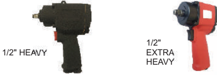
1/2" HEAVY 1/2" EXTRA HEAVY