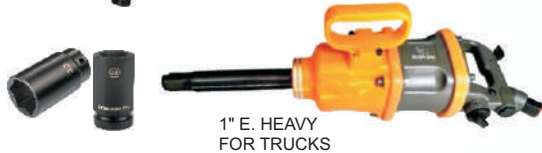
1" E. HEAVY FOR TRUCKS