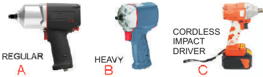
REGULAR A HEAVY B C) CORDLESS IMPACT DRIVER