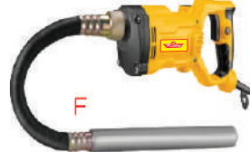
F PROFESSIONAL INDIAN