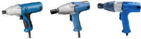
8MM IMPACT DRIVER 1/2" REGULAR 1/2" HEAVY