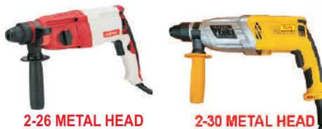
2-26 METAL HEAD

Note: All kinds of spares &amp; Accessories are available